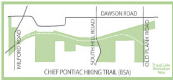
DETAIL OF KENSINGTON METROPARK EAST OF MILFORD ROAD

HELMET REQUIRED FOR INLINE SKATERS AND CYCLISTS * No Alcoholic Beverages